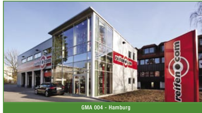
GMA 004 - Hamburg