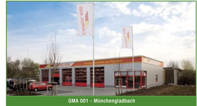
GMA 001 - Mönchengladbach